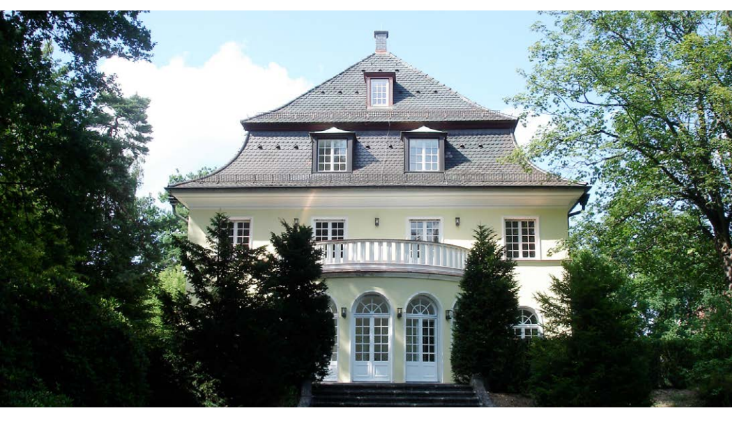
ISO headquarters in Nuremberg – a monument protected building

The ISO-Gruppe, with offices in Nuremberg, Munich, Frankfurt, Berlin, Karlsruhe and Würzburg as been chosen twice as one of Germany's "TOP 100" companies in recent years. This award underscores the remarkable innovative capacity and exceptional inventive success of medium-sized enterprises in Germany. About 620 employees work at several sites throughout Germany as well as at associate companies in Austria, Poland, and Canada. The ISO Software Systeme, ISO Travel Solutions, ISO Professional Services, and ISO Public Services are all certified according to the requirements of their quality management system per DIN EN ISO 9001:2015.